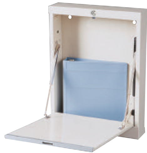
Cat. No. 4653-00 Shown with side-opening Ringbinder (sold separately).