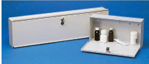
Cat. No. 6687-00 (Full size)