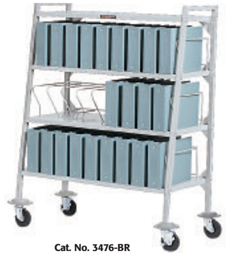
Cat. No. 3476-BR