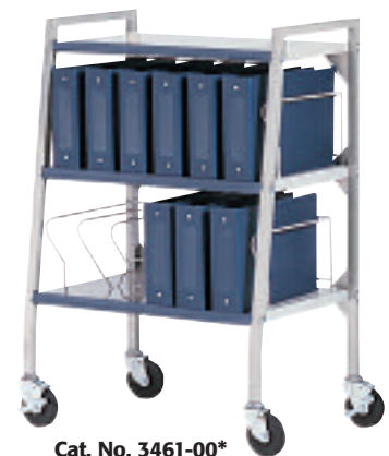
Cat. No. 3461-00*