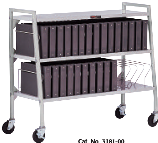
Cat. No. 3181-00