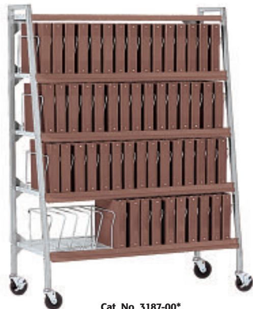
Cat. No. 3187-00*