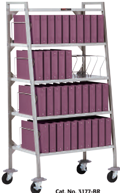
Cat. No. 3177-BR