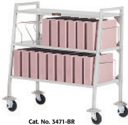
Cat. No. 3471-BR