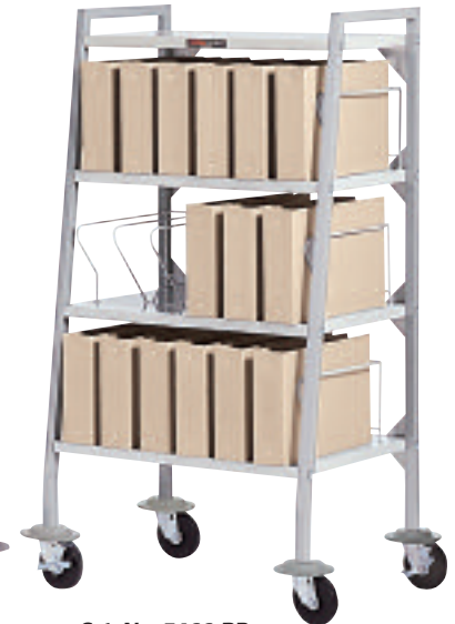
Cat. No. 3466-BR