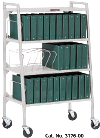
Cat. No. 3176-00