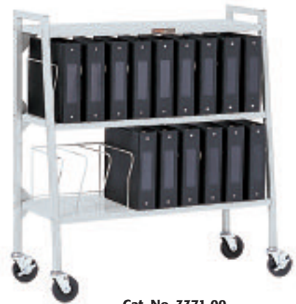
Cat. No. 3371-00