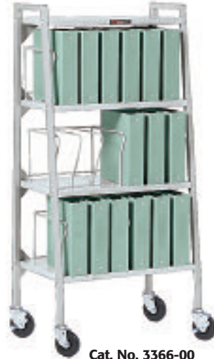
Cat. No. 3366-00