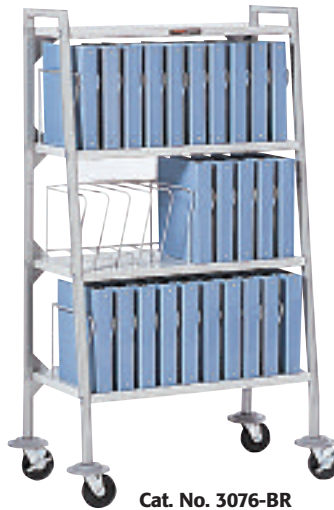
Cat. No. 3076-BR