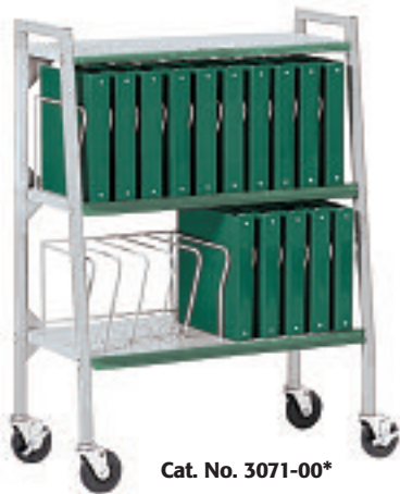
Cat. No. 3071-00*