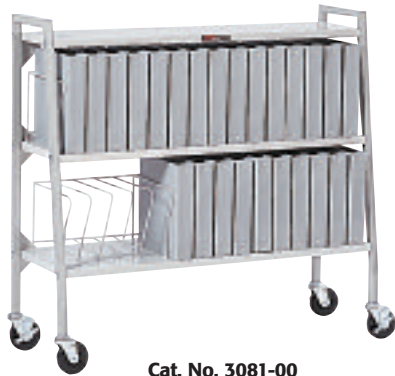
Cat. No. 3081-00