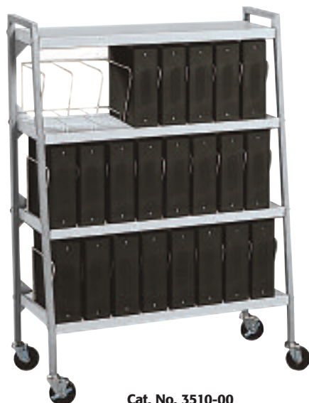
Cat. No. 3510-00