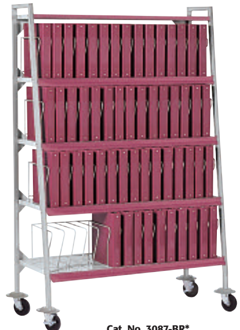
Cat. No. 3087-BR*