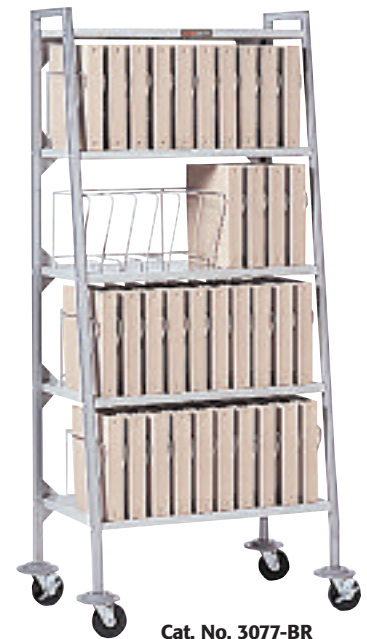
Cat. No. 3077-BR