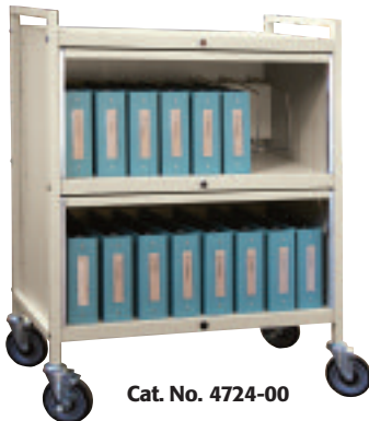
Cat. No. 4724-00