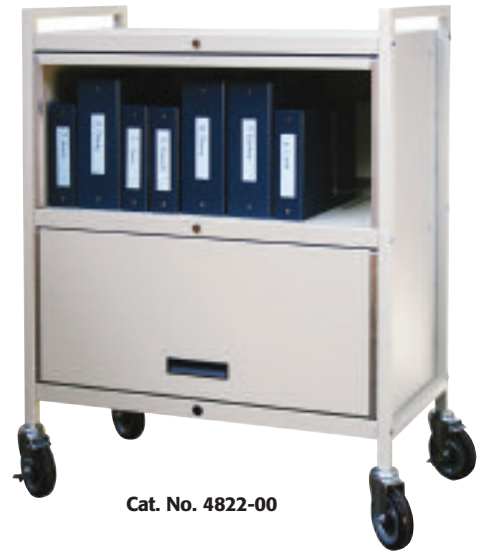
Cat. No. 4822-00