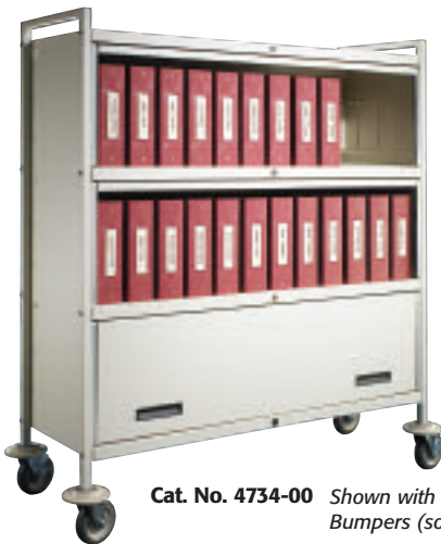
Cat. No. 4734-00 Shown with optional Rubber Bumpers (sold separately).