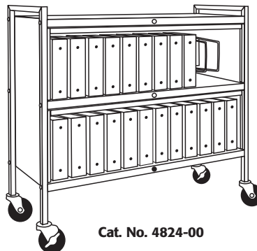
Cat. No. 4824-00