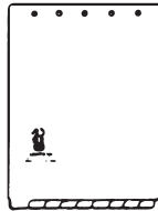
Top-Opening Tabs along 8½" bottom