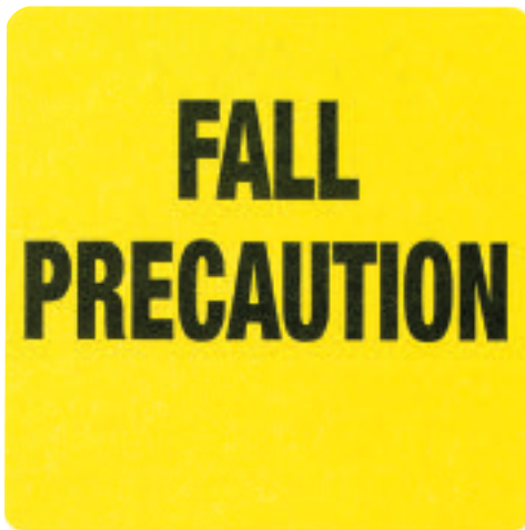
Cat. No. 1646-45 (Actual Size) 2½" x 2½"