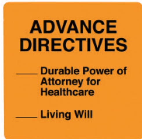
Cat. No. 1646-26 (Actual Size) 2½" x 2½"