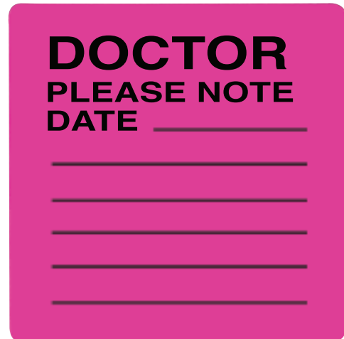
Cat. No. 1646-24 (Actual Size) 2½" x 2½"