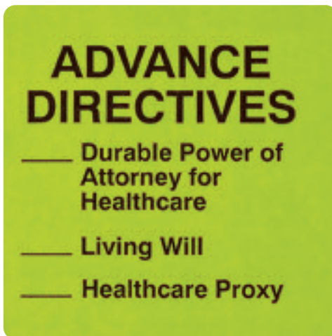
Cat. No. 1646-27 (Actual Size) 2½" x 2½"