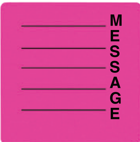
Cat. No. 1646-25 (Actual Size) 2½" x 2½"