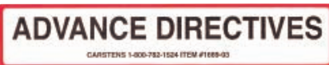
Cat. No. 1669-03