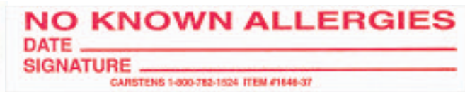
Cat. No. 1646-37