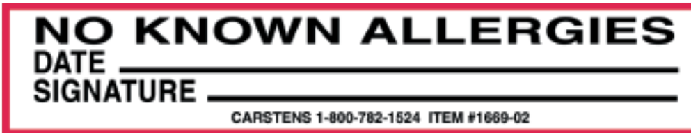
Cat. No. 1669-02