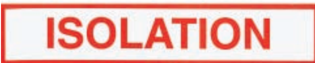
Cat. No. 1669-05