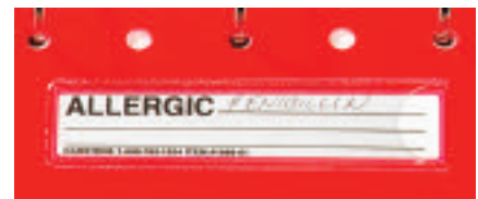
Alert Cards Cat. No. 1669-00 Allergic Card See page 20 for full selection Cat. No. 1639-00 Adhesive Vinyl Pocket See page 13