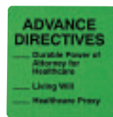
Alert Labels Cat. No. 1646-27 Advance Directives Label See page 23