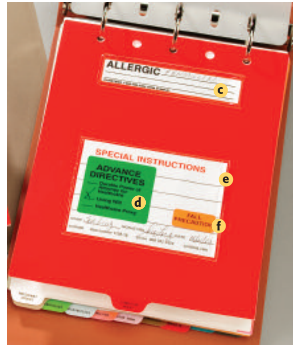
Cat. No. 2623-39

a. Adhesive Card Pocket - Cat. No.1639-00 b. Special Instructions Card - Cat. No.1728-10 c. Allergic Card - Cat. No. 1669-01 d. Advance Directive Label Cat. No. 1646-27 e. Adhesive Pocket - Cat. No. 1728-00 f. Fall Precaution Alert Label - Cat. No. 1646-46 g. DNR-No Code Alert Label - Cat. No.1669-04 h. Patient Diabetic Alert Label - Cat. No. 1683-04