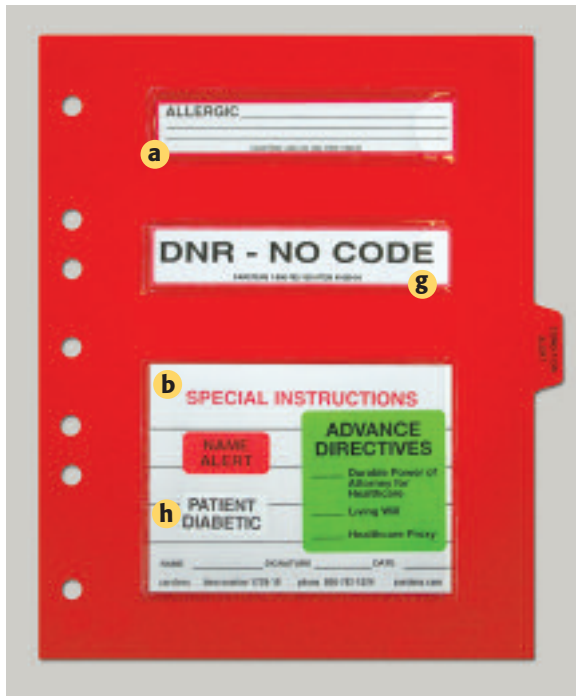
Cat. No. 2620-39