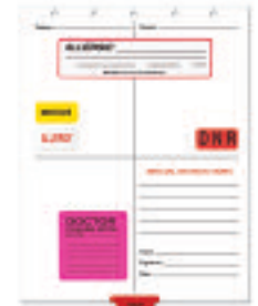
Cat. No. 2417-01 ▶