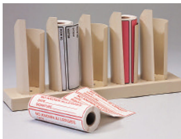
Cat. No. 1651-00

Conveniently holds five rolls of Carstens Wide-Trak or Chart I.D. Labels. (Labels sold separately)