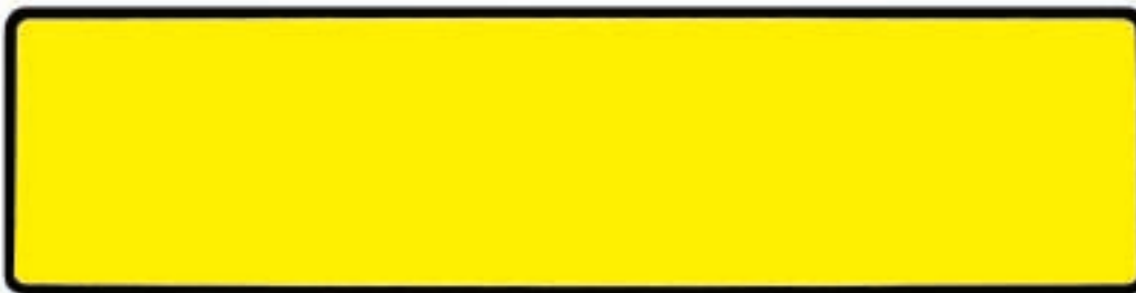
Cat. No. 2645-03