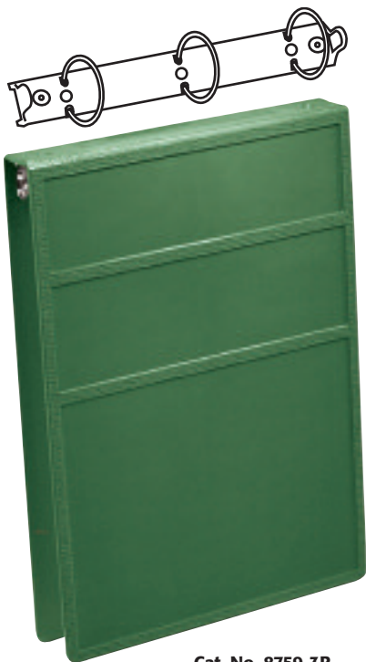
Cat. No. 8759-3R