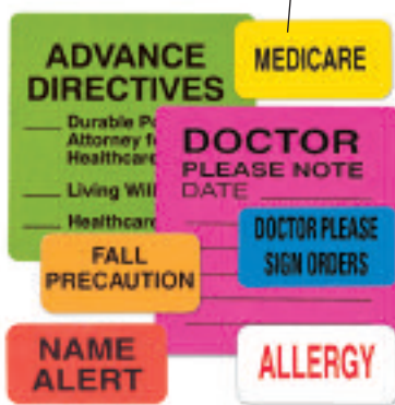
Alert Labels - Pages 22-24