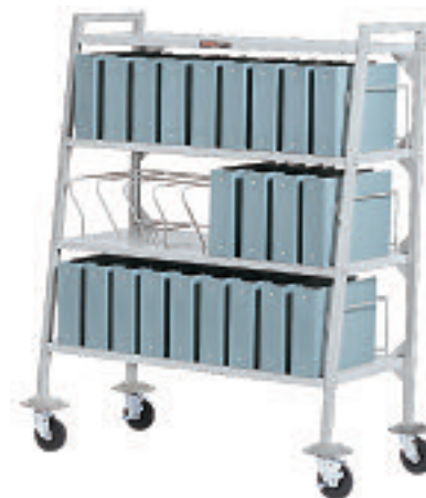
Don't forget : Storage Racks - Pages 42-50