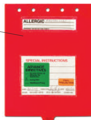
Condition Alert System Page 20