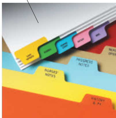
Dividers - Pages 28-35