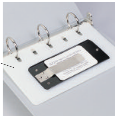
Sheet Lifters - Page 19